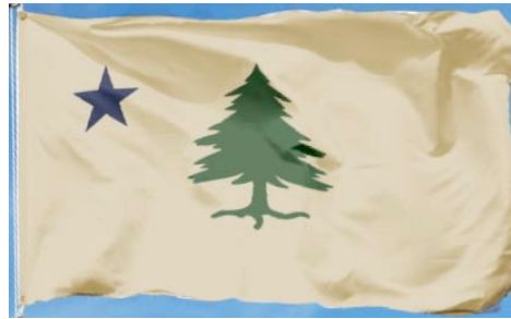
Dirigo Flag Co.