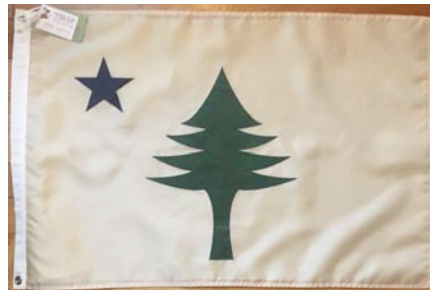
Maine Flag Co.