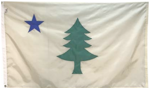
Gettysburg Flag Co.