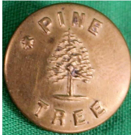
Railroad Button c.1902