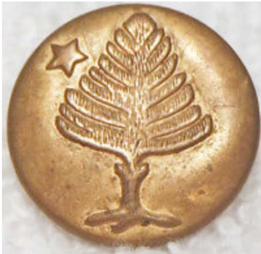
Militia Button, 1901-1909