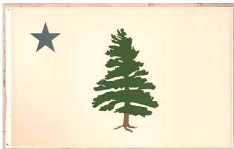
Maine Stitching Co.