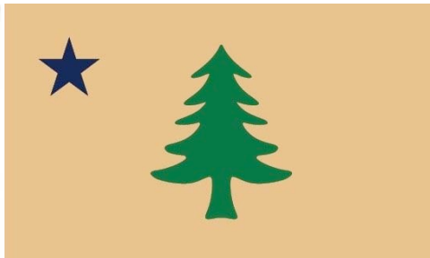
Gorham Flag Co.