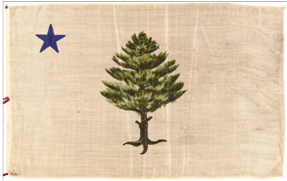
1908 Souvenir Flag, AYPE, Seattle WA

In 1909, with the legislature containing more ex-Civil War soldiers than ever and following the retirement of General Richards, it was decided to change the flag to be more military-like. Indeed, the description of the new flag could not have been more dissimilar than the 1901 flag, requiring it be made of silk, "...of the following dimensions and design; to wit, the length, or heighth, of the staff to be nine feet,