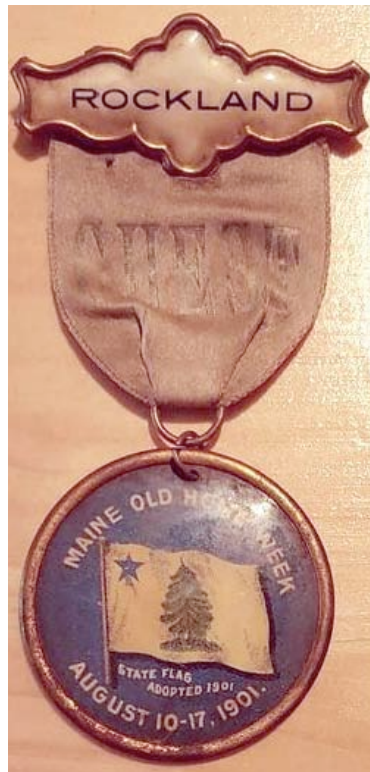
Rockland, Maine Old Home Week Guest Badge